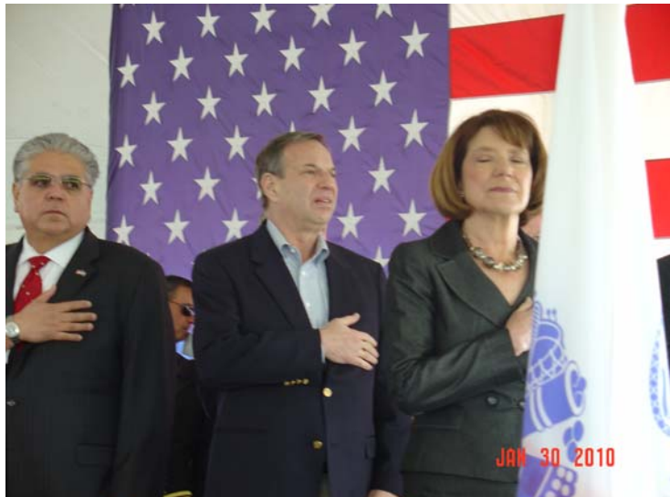
Miramar National Cemetary ground breaking ceremony.